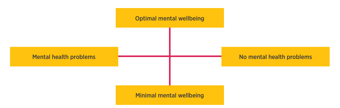
Figure 1: Mental health continuum – the intersection of mental wellbeing and mental health problems

Mental wellbeing describes our ability to cope with the day-to-day stresses of life, work productively, interact positively with others and realise our own potential. When we talk about wellbeing, we are referring to mental wellbeing. Our wellbeing can fluctuate day-today, hour-by-hour and is influenced by many things in our lives, personal or professional. People with mental health problems can still have high levels of general mental wellbeing, while those without mental health problems can experience periods of low levels of mental wellbeing.