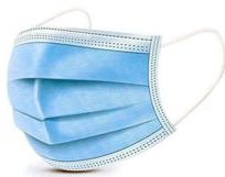
Fluid resistant surgical face mask