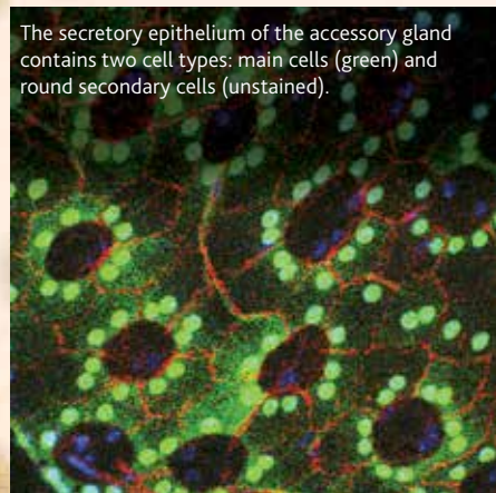
The secretory epithelium of the accessory gland contains two cell types: main cells (green) and round secondary cells (unstained).

Among the destinations of cargo transported from the cell surface, mature – or late – endosomal and lysosomal compartments (LELs) have traditionally been characterised as merely degradation and recycling centres for unwanted cellular matter. Recently, however, LELs were identified as key elements in cancer, enabling cells to sense the amino acids that surround them and so allowing them to obtain nutrients both internally and externally to fuel their